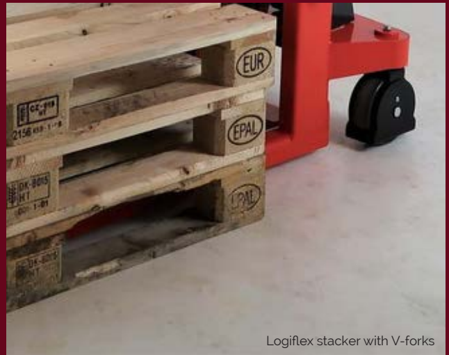
Logiflex stacker with V-forks