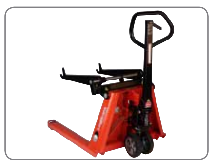
Compact, very manoeuverable and ensuring the operator ergonomically correct working conditions.

Strong construction and low maintenance costs.