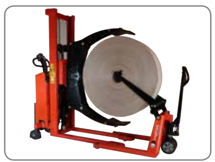
Reel Lifter is a unique partner to Reel Rotator.