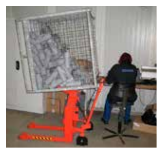
Perfect working position when emptying boxes and crates - sitting as well as standing.