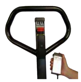
Remote control for the tilt function.